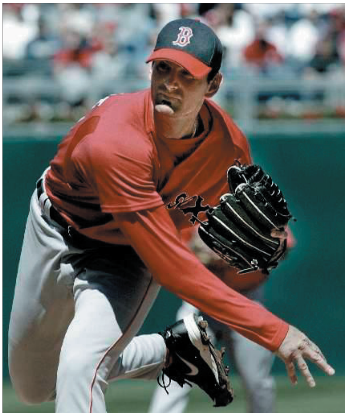
Red Sox pitcher Matt Clement throws against the Philadelphia Phillies in the first inning during an exhibition game yesterday in Philadelphia. The Phillies won, 5-0, but the Sox will take the field for real today in Texas at 2:05. See SportsMonday for complete coverage.